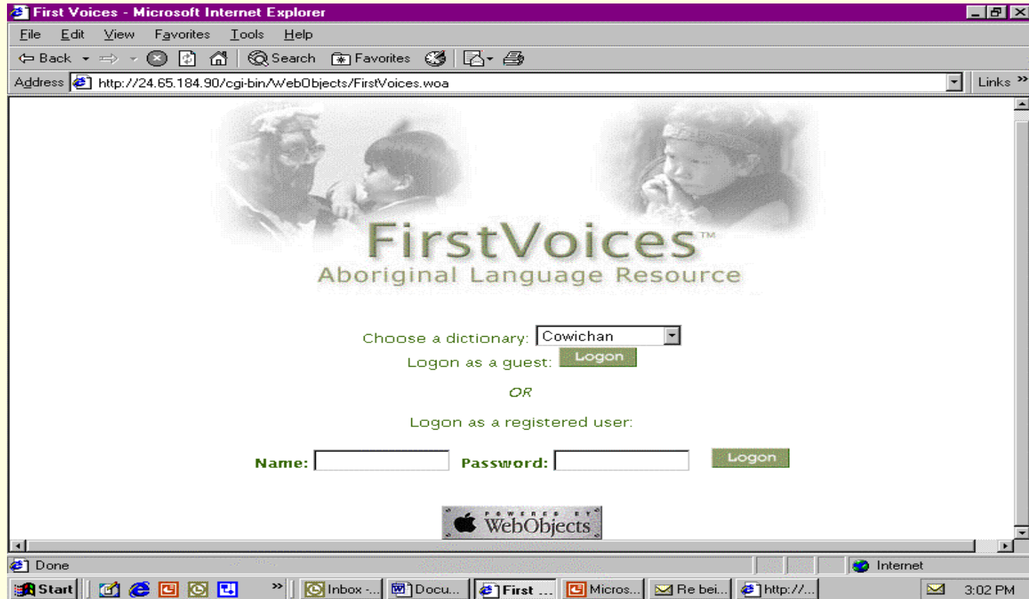
FirstVoices.com Web site login screen