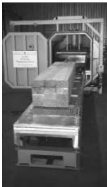
HeatWave's E-field vacuum kiln for drying wood.

At the beginning of 2001, CBT started collecting rent on its Columbia Basin Building in Castlegar and a portion of the building was sold to the City of Castlegar. Through its real estate portfolio, the CBT also has $1.3