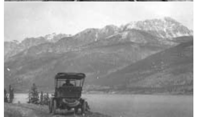
Top left: Unknown fisherman catching two Dolly Varden trout in the Elk River. Top right: Town of Waldo. Middle: Historic bridge in Fernie. Bottom: Tourists at Columbia Lake.