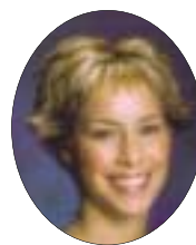
Kaitlin Pasqualotto Trail