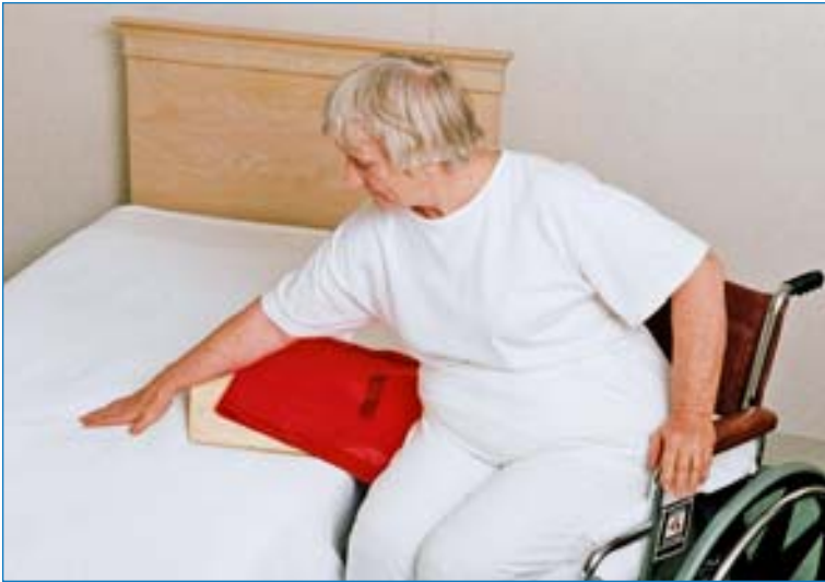
Roller sheet on transfer board