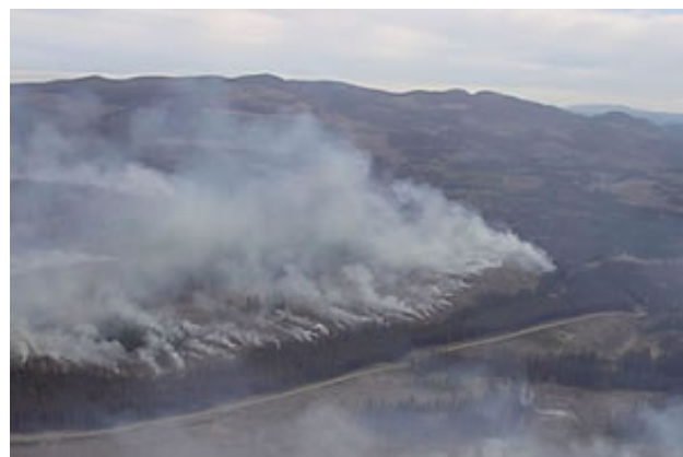
Figure 1: Large scale forestry open burning of piled debris

Burning can be considered a legitimate management tool, as in the case of certain land management objectives, or simply as an easy method of waste disposal. In B.C., resource management open fires are regulated by the Wildfire Act and Regulation whereas open burning for waste disposal is regulated either through the Open Burning Smoke Control Regulation or through permits, approvals and solid waste management plans.