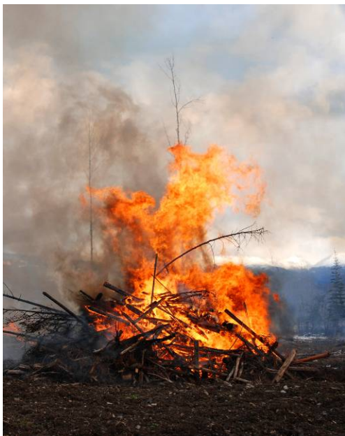
Figure 3: Open burning vegetative debris pile

Along with open burning of vegetative debris, including land-clearing burning, and forestry-related open burning of debris piles, the ministry intends to amend the Open Burning Smoke Control Regulation to include open burning of wood waste at remote primary wood manufacturing facilities (e.g., at remote log sort and forwarding facilities).