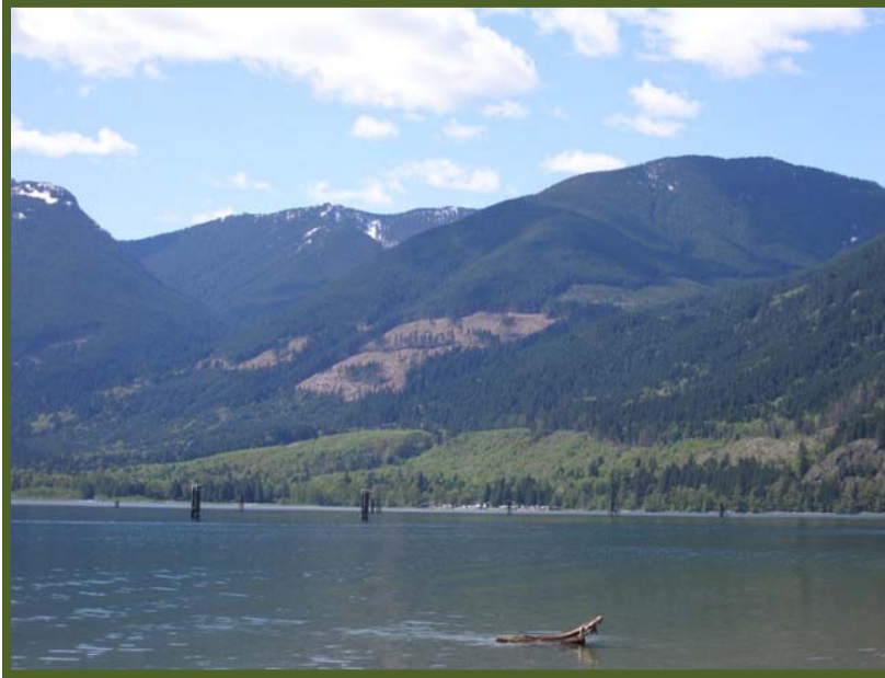
May 2, 2006 – Kilby Beach viewpoint, MFR photo.

As harvesting progressed, the licensee encountered a significant blowdown problem and, in one case, an entire leave strip fell. The licensee discussed the issue with MFR district staff and further altered its harvesting on the remainder of the cutblock to try and retain more trees. The licensee also adjusted its prescription for the adjacent cutblock. Cutblock 40 was considerably smaller than cutblock 39 and had been approved as a clearcut without any reserves. The licensee added a reserve patch of timber to reduce the total visual impact of the two cutblocks. Cutblock 40 was subsequently harvested.