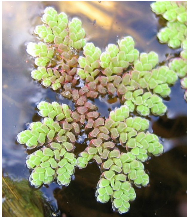
Figure 1. Mexican mosquito fern, Little Fort, BC.

In spite of several taxonomic treatments of Azolla species, taxonomy and identification are generally considered difficult (Moore 1969; Pereira et al. 2001; Evrard and Van Hove 2004; A. Ceska, pers. comm., 2005). Pereira et al. (2001) indicate that many previously described diagnostic vegetative and reproductive characters are environmentally influenced and vary with the collection site.