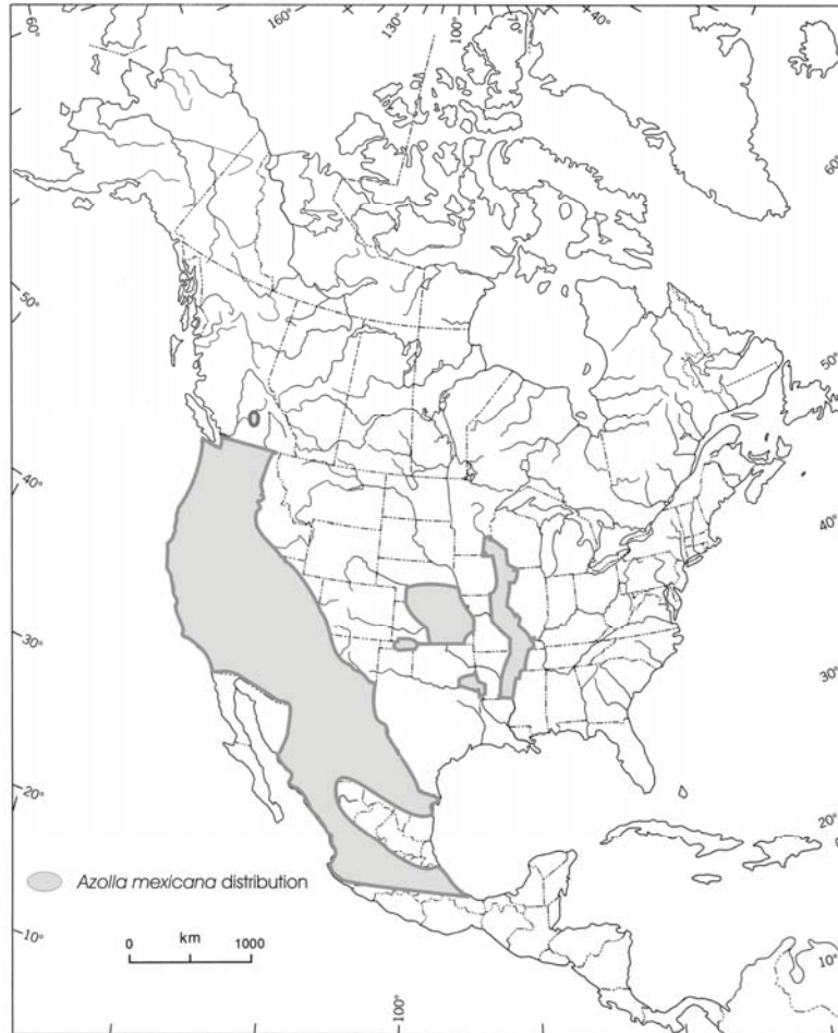
Figure 2. North American distribution of Mexican mosquito fern from Brunton (1984), Environmental Lab (2002), USDA (2007).

In Canada, Mexican mosquito fern is found only in B.C. (Figure 3), where it reaches the northern limits of its distribution (Brunton 1984). It was first collected in the province in Sicamous in 1889, and reported from Salmon Arm in 1890 by John Macoun (Brunton 1984). Since then, it has been reported at an additional nine locations, all in south-central B.C. in the area of Little Fort/North Thompson River, Shuswap Lake, and Vernon (Douglas 2004; B. Klinkenberg, pers. comm., 2007). Less than 2% of the global population is found in Canada (Douglas 2004).