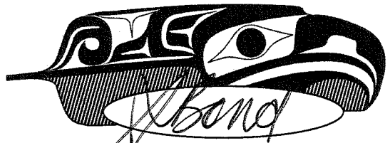
Shirley Bond Minister of Education