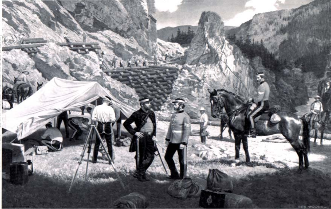
Painting of Royal Engineers on the Cariboo Road by Rex Woods. Image PDP03696 Courtesy of the British Columbia Archives.

New communities sprang up and there was a need for infrastructure. Some 500 miners were recruited to build a road into the Upper Fraser River area. 51 On October 11, Douglas wrote that he had sent a surveyer to lay out towns sites on the Fraser River for Old Fort Langley, Fort Hope and Fort Yale. 52