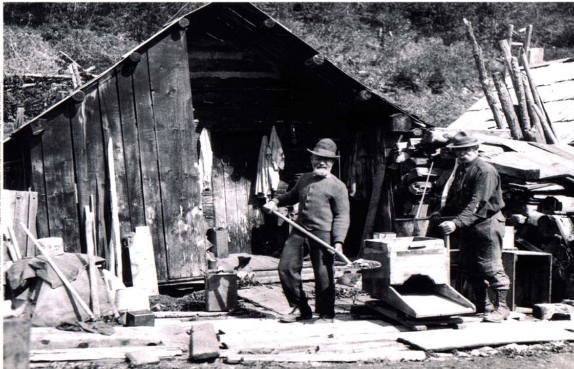
Prospectors in Barkerville, the gold rush town named in honour of Billy Barker, who arrived in the colonies in 1858. Photo taken in 1890s.

About 30,000 people went to the British Columbia mainland in 1858, according to Barman. Those numbers were not repeated the next year. 20 Victoria began 1858 with a population of about 300, sheltered about 6,000 people at the height of the rush, but “only retained at most 3,000 over the long term,” 21 wrote Barman.