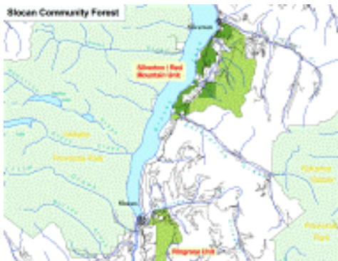
Slocan Valley Community Forest