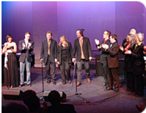
For the Love of Theatre performance in Cranbrook.