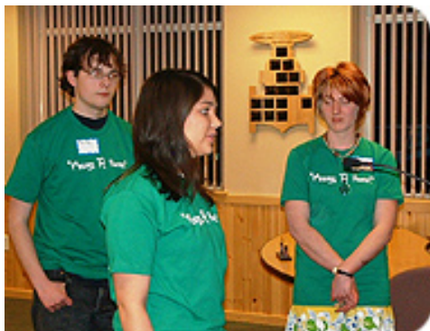
Peer Leaders share their experiences with new program.

In 2004, the Nelson and District Youth Centre (NYDC) completed a youth survey on youth needs, which identified youth were not aware of, or did not know how to access community youth services. In response to that need, the Peers R Here program was born. ...more