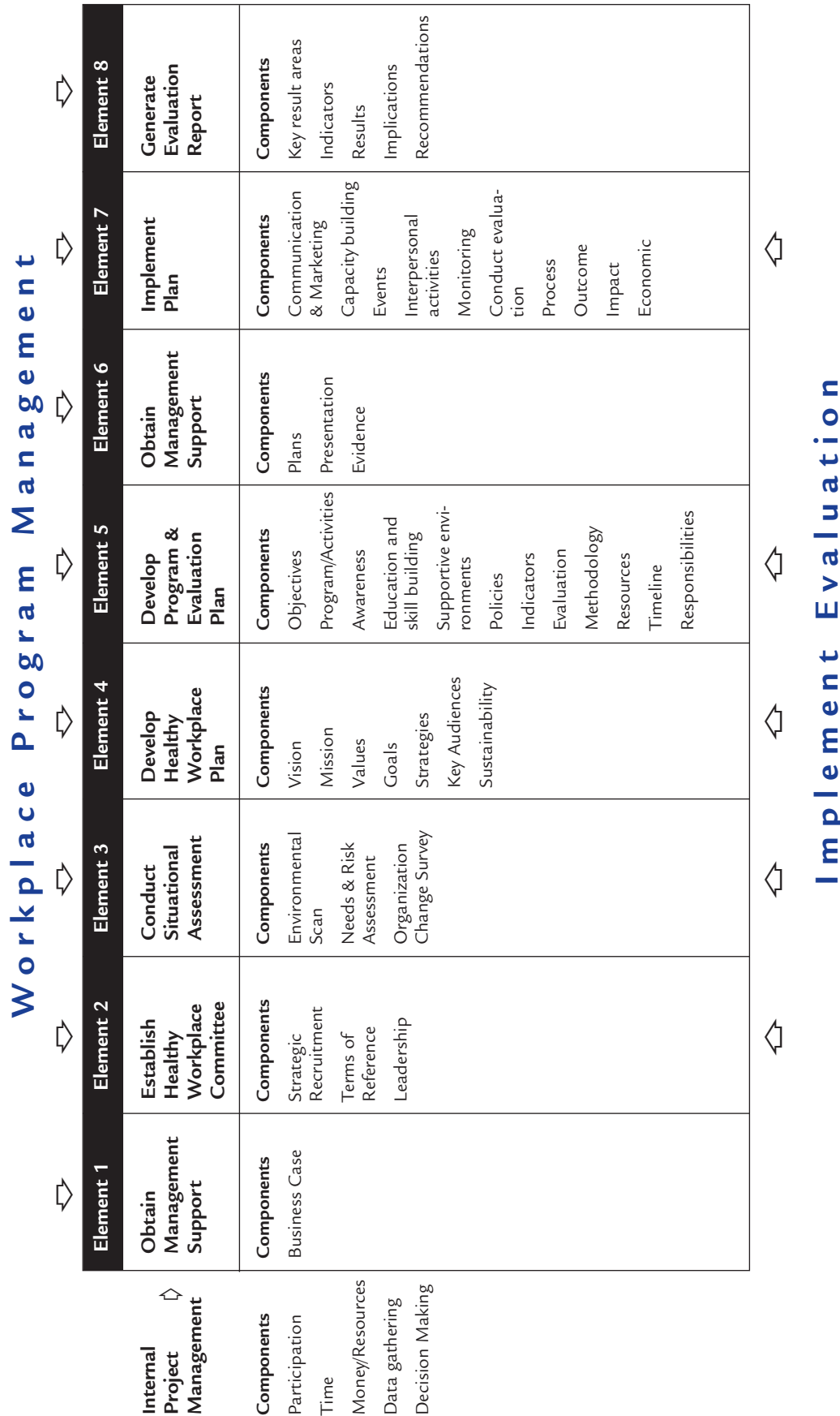
Figure: Adapted from: http://www.thcu.ca/workplace/documents/intro_to_workplace_health_promotion_v1.1.FINAL.pdf