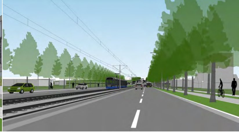
Figure 3 King George Boulevard Alignment