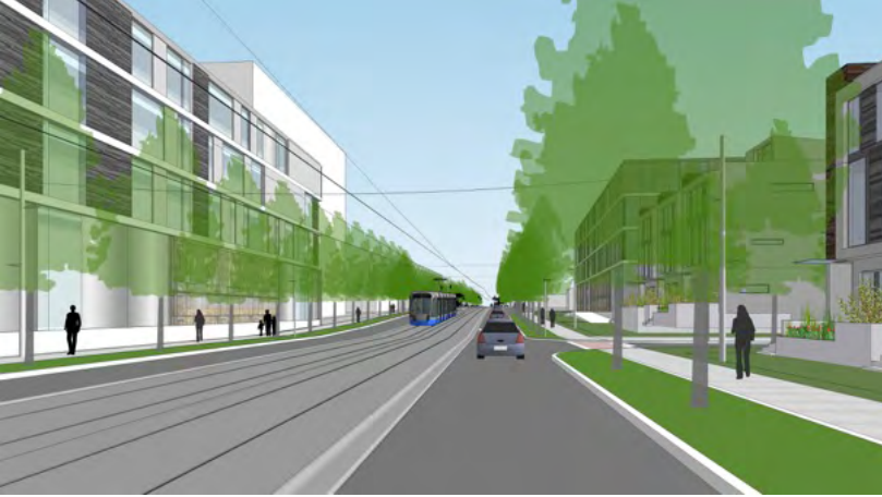
Figure 2 104 Avenue Alignment