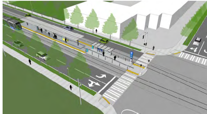
Figure 4 Sample Centre Platform LRT Stop