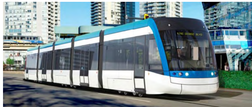
Figure 5 Sample LRT Vehicle Design

The main construction activities for the Project are construction of the guideway, stop and exchange upgrades. Construction includes site preparation, utility relocation, operation and maintenance facility construction, implementation of environmental mitigation measures, operating systems installation, and system commissioning.