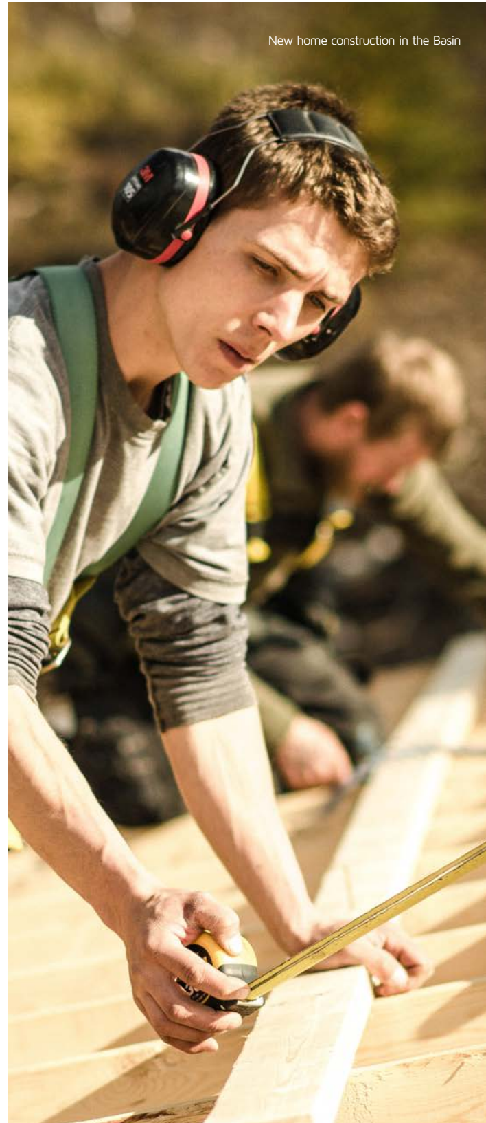
New home construction in the Basin