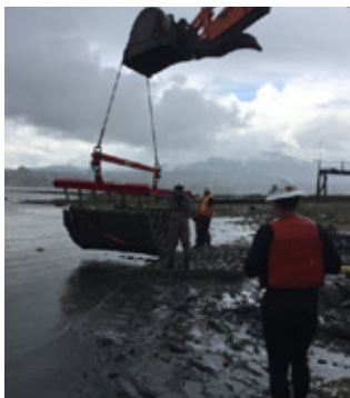
Crews place concrete mats over newly installed conduits (ducts) in the intertidal zone on Protection Island.

Construction on the new crossing began in spring 2020 and included conduit (duct) installation at Pirates Park on Protection Island and Maffeo Sutton Park in Nanaimo. Laying of the submarine cable occurred over two days in August with a team of divers working off a large barge in McKay Channel to place with precision the new cable on the ocean floor. Careful consideration is given to tides, currents, undersea terrain, ecosystems and marine traffic. A portion of the on-shore work must be coordinated with extreme low tides, leaving a construction timeline with little wiggle room.