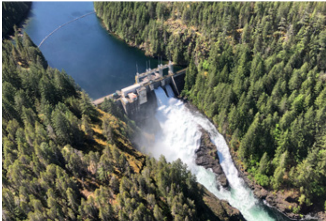
Ladore Dam is one of the dams in the Campbell River system.