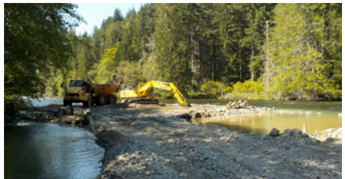
In the summer of 2019 with FWCP funding, 4,000 metric tonnes of gravel were placed 300 metres downstream of the John Hart Generating Station in the Campbell River area. The project, led by the Campbell River Salmon Foundation, has added 3,143 m 2 of Chinook salmon spawning habitat. It will also support coho, chum, and steelhead population.

Since 1999, the FWCP has committed more than $38.6 million to support fish and wildlife in its Coastal Region. Learn more at fwcp.ca .