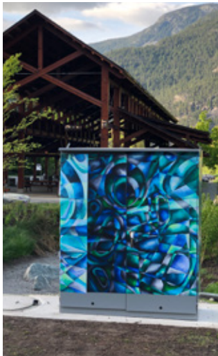
Example of a decorative wrap on our pad-mounted equipment.

Our Decorative Wrap Grant Program provides financial assistance to municipal governments looking to improve the visual aesthetics of a neighbourhood by installing decorative wraps on BC Hydro-owned pad-mounted equipment boxes. Eligible applicants can receive grant funding of $350 or $700 per unit, depending on the size of the equipment box to be wrapped. The funding amount will be determined by BC Hydro during the application review.