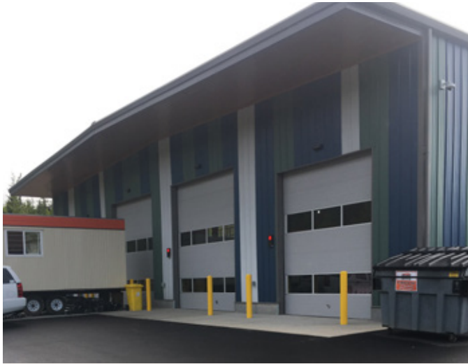
Vehicle truck bays at the new office can accommodate the new, larger field trucks.

This substation expansion resulted in less than ideal access to the office building as the existing 470 m 2 (5056 ft 2 ) Long Beach Office, built in 1999, is located within the confines of the substation, just east of the Tofino/Ucluelet junction. The current local office does not meet the operational needs of our 5 full-time and 2 drop-in personnel.