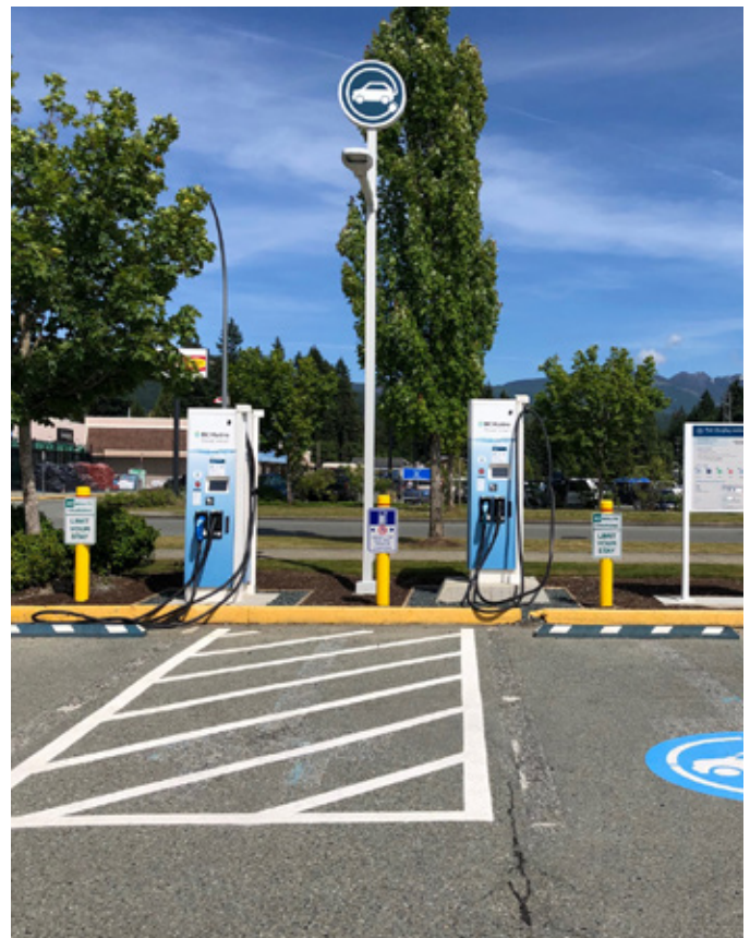
Electric vehicle dual charging stations at Port Alberni's No Frills.