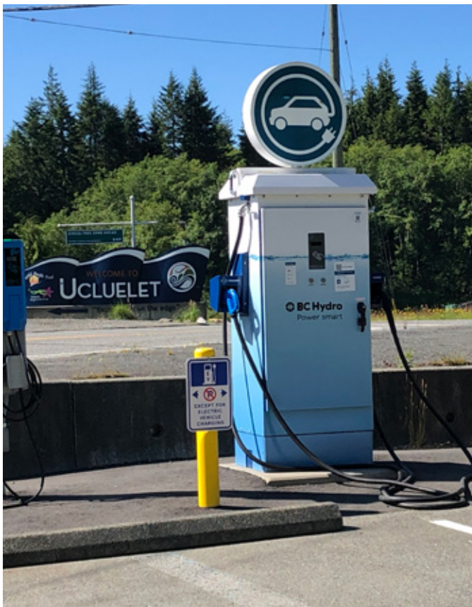
Electric vehicle charging station at the Tofino/Ucluelet junction.