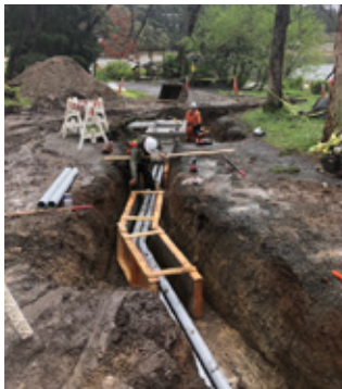
Crews installing conduit on Protection Island.

Many coastal communities are reliant on submarine cables for their electrical service. About 40% of our power is generated on Vancouver Island, with the remainder supplied by two transmission submarine cable systems crossing the Strait of Georgia. The older of the two systems, built in the 1980s, crosses from the Sunshine Coast, over Texada Island and lands at Qualicum Bay. In 2008, new transmission cables replaced the 1950s cable system between Tsawwassen and Duncan. In addition to those two transmission crossings, over 250 kilometres of distribution submarine cables provide power to islands off the Island, and to islands off islands off the Island.