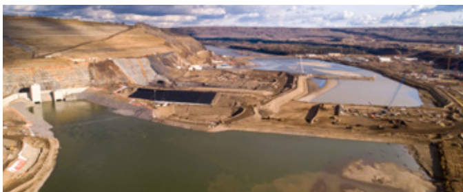
The Site C project achieved river diversion in October 2020.

For more information on Site C, please select sitecproject.com .