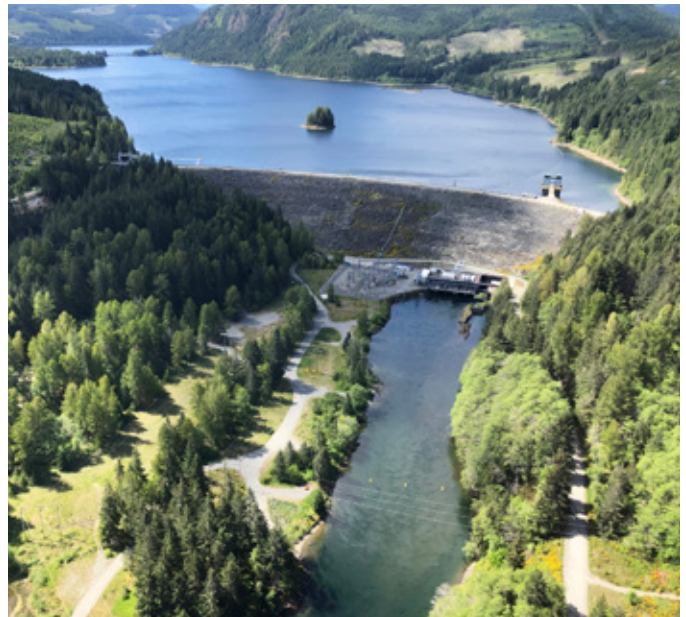
Strathcona Dam, one of the dams in the Campbell River system, is the largest dam on Vancouver Island.

For the Campbell River hydroelectric system, we have three dams, built in the 1940s and 1950s, that will have improvements so they can withstand a severe earthquake. We’ve proposed seismic upgrades for the Strathcona Dam, downstream at the Ladore Dam, and below that at the John Hart Dam.