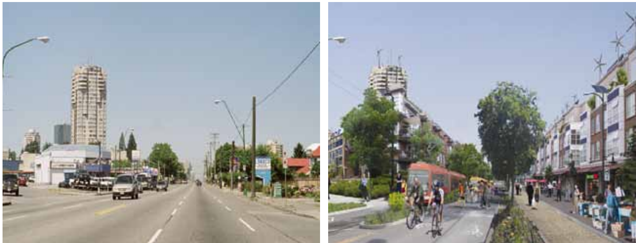
■ Figure 1. The shift to sustainable communities requires consideration of 1) mitigation strategies, such as increased alternative transportation corridors (rail, bikes, etc.), zero energy buildings, and district energy systems fuelled by renewable sources, and 2) adaptation strategies, such as increased permeable surfaces to adapt to increased rainfall and increased street trees for shading under increased temperatures.

be guided by initiatives that combine strategies for sustainable development and responses to climate change. Regardless of its size, the sustainable community is generally characterized by densification, mixed land use, sustainable water and transportation systems, a net-zero energy system, and a diverse local economy. Furthermore, the sustainable community is the site of integration of local-level adaptation and mitigation actions with development choices in the arenas of policy formation, decision-making, governance and behaviour change (Wilbanks and Sathaye 2007) (see Figure 1). To better understand how sustainable communities are intricately linked to climate change mitigation and adaptation choices, the remainder of this section adopts a backcasting approach (Robinson, 2003) and describes how a successful sustainable and resilient community might look in British Columbia in the decades ahead. The intent here is not to predict the most likely future for BC, but to sketch the outlines of what changes might occur that would improve community sustainability and in so doing respond effectively to the climate change challenge, including expected climate change impacts. Such future visions can then serve as the basis for analysis of what policy choices and measures would be required to move us in the direction of such outcomes.