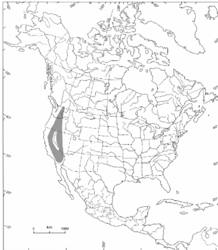
Figure 2. Distribution of branched phacelia in North America (from COSEWIC 2005). Map shows the range of variety ramosissima , the only one occurring in Canada.