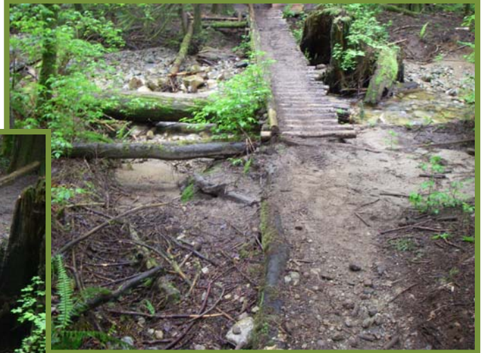
Trail approach to walkway introduces silt and soil to Kathryn Creek.

There is evidence that motorized vehicle use has damaged soil and introduced material to streams at the Kanaka Creek ford and at the Kathryn Creek crossing. Damaged soil and introduction of material into streams are events listed in section 3 of the FPPR, meeting the first of two elements of the regulation that define damage to the environment.