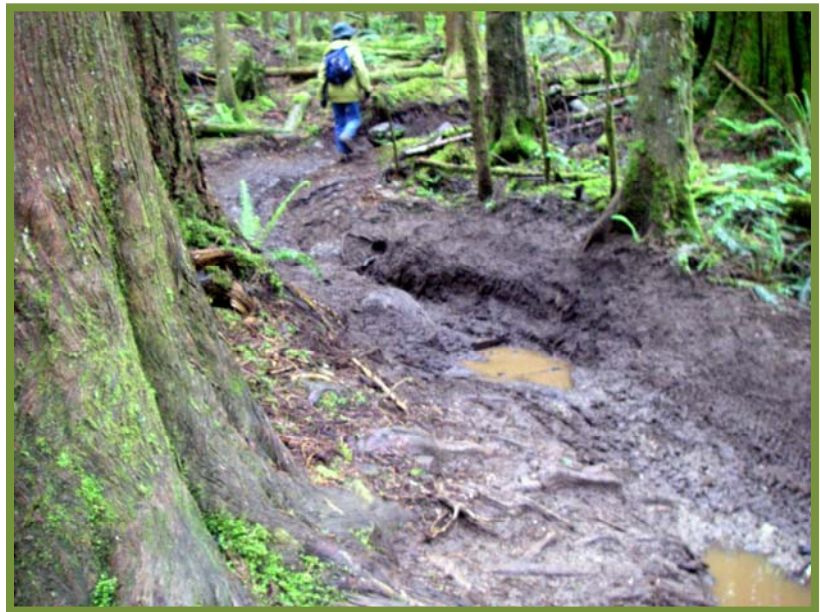
Soil disturbance, rutting, and water accumulating on trail.