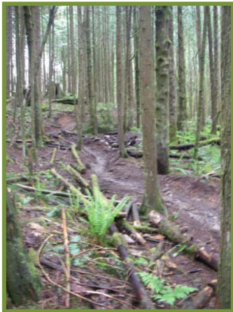
Trail with inadequate surface drainage.

The rutted condition of the trails, the damage to soil and the erosion into the creeks did not occur from a single use, but from repeated use. Furthermore, poor trail and crossing design along with a lack of cross-drainage on the trails, contributed to impacts. Subsequently, there have been trail improvements and footbridge construction to reduce further damage.