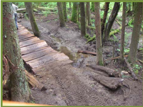
New boardwalk over wetland area with previous ATV or motorcycle impacts