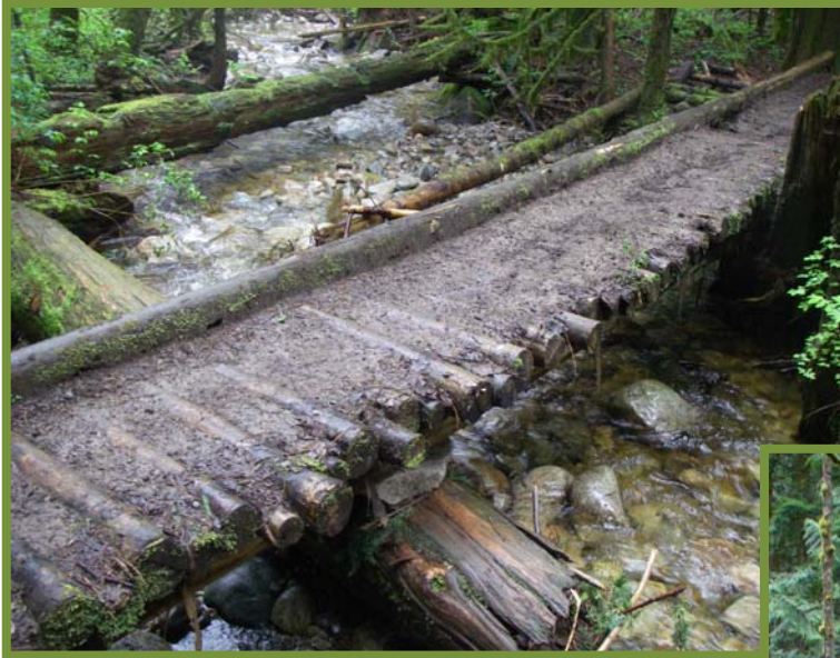
Accumulation of silt and soil on walkway over Kathryn Creek.