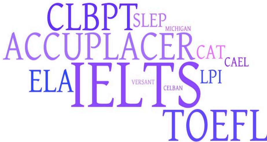
Graphic Representation of Frequency of Assessment Used

While all respondents reported that they use in-house tests for placement, they use other tests as well for placement and for entrance into academic programs. Ten accept IELTS, seven accept TOEFL, six accept Accuplacer, six accept CLBPT (three programs at VCC), five accept ELA (four programs at VCC), three accept LPI, three accept SLEP, three accept CAT, two accept CAEL, one accepts CELBAN, one accepts Michigan, and one accepts VERSANT (currently being piloted for overseas use). (See Glossary for acronym explanations.)