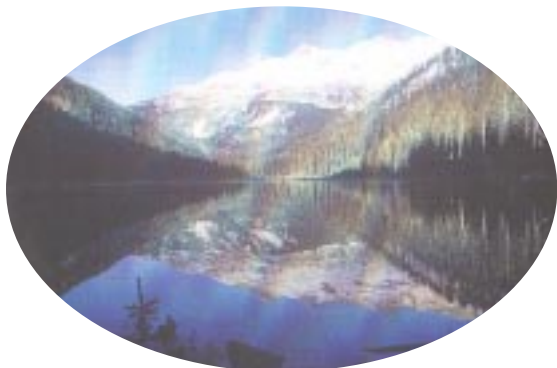
Gibson Lake, Kokanee Glacier Park Peter Tasker

its throat that can hold about 90 seeds. Using its pouch, the nutcracker can carry over 30,000 seeds to winter storage places. Uneaten seeds sometimes germinate in clusters to form small groves of trees. The nutcracker's amazing memory enables it to find the exact location of thousands of seed caches. Sometimes it may dig through a metre of snow to find them.