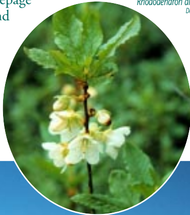
White-flowered rhododendron Rhododendron albiflorum Del Meidinger

stays moist throughout the growing season.