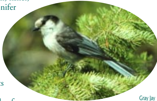
Gray Jay Perisoreus canadensis