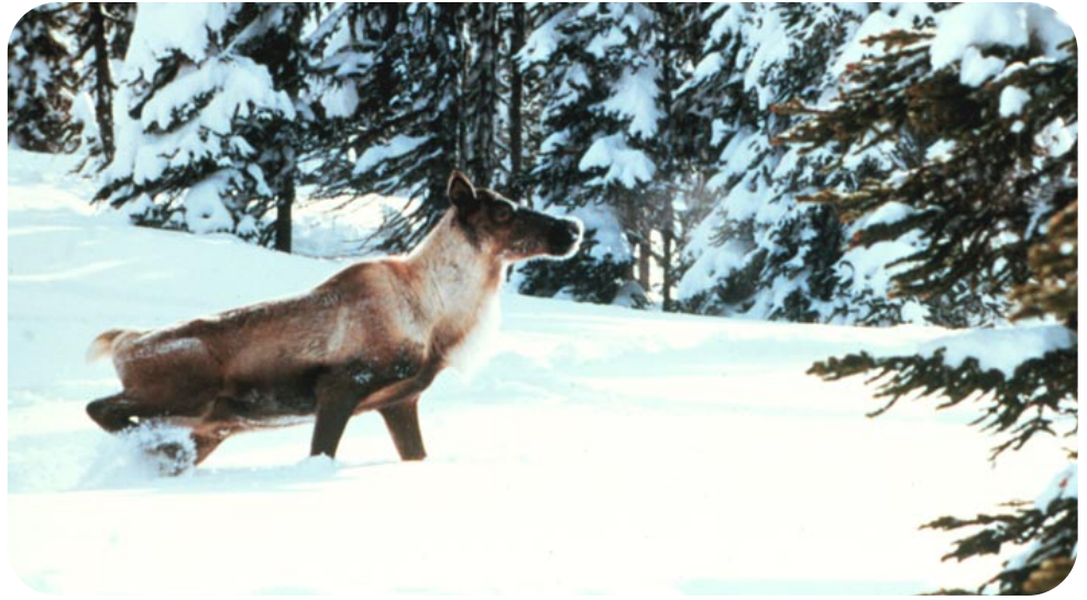
Caribou Rangifer tarandus MOF

Furbearing animals such as marten, fisher, and wolverine also use the zone's conifer forests for habitat, along with the highly characteristic Gray Jay and seed-eating birds such as the Red Crossbill, White-winged Crossbill, Pine Siskin, and Clark's Nutcracker. Golden Eagles make their nests in south-facing cliffs where they can feed on large rodents such as the hoary marmot and the Columbian ground squirrel. Clouds of no-see-ums are also a familiar feature of forests in the Engelmann Spruce – Subalpine Fir Zone.