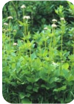
Sitka valerian Valeriana sitchensis F. Boos

These subalpine meadows contain a variety of showy, flowering herbs, including Indian hellebore, arrow-leaved groundsel, subalpine daisy, paintbrush, foam-flower, and Sitka valerian, which gives the Engelmann Spruce – Subalpine Fir Zone its characteristic scent. Grasslands are limited, but they are a conspicuous feature