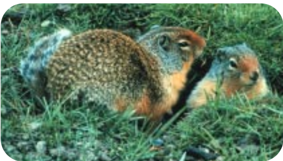
Columbian ground squirrels Spermophilus columbianus MOF

There are relatively few species at risk in this zone, however, the mountain beaver is one. It is restricted to the Cascades and little is known of its ecology in B.C.