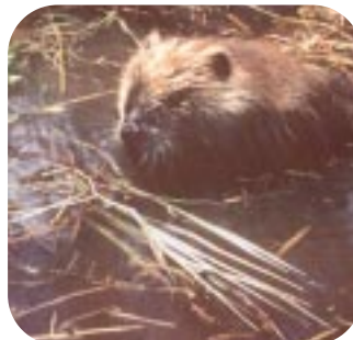
Mountain beaver Aplodontia rufa MOELP

There are relatively few species at risk in this zone, however, the mountain beaver is one. It is restricted to the Cascades and little is known of its ecology in B.C.